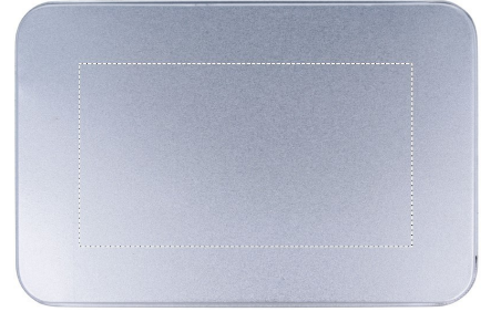
3. BOX SCREEN