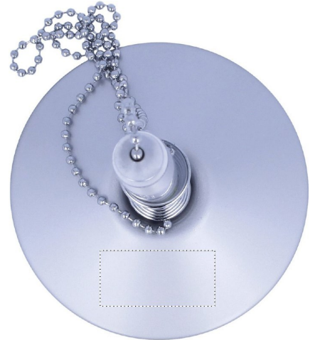
3. PEN HOLDER